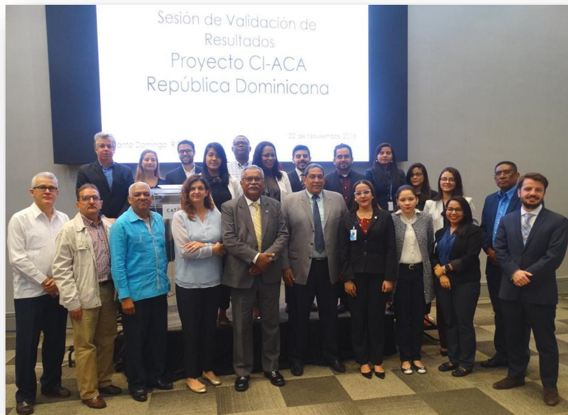
CI-ACA Dominican Republic and Panama