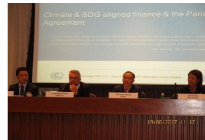
UN ESCAP WG, innovative climate finance, May 2017