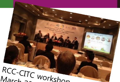
RCC-CITC workshop, March 2017