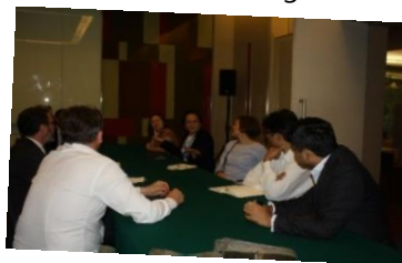
Norwegian Carbon Credit Program marketplace meeting, March 2016