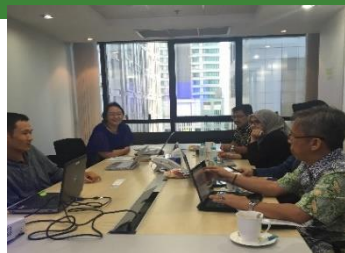
Indonesian DNA training, Dec 2015