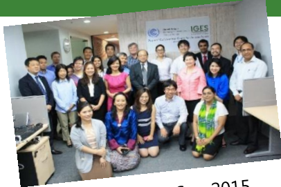
Launch event, Sep 2015