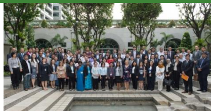
Asia LEDS Forum 2016, June 2016