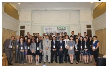
INDC workshop, Feb 2016