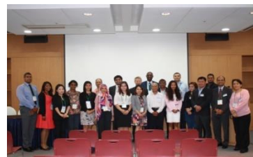
APCF, Sept 2016