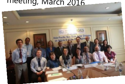
Asia-Pacific non-state actor Article 6 dialogue, June 2016