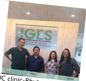
INDC clinic-Bhutan, Sep 2015