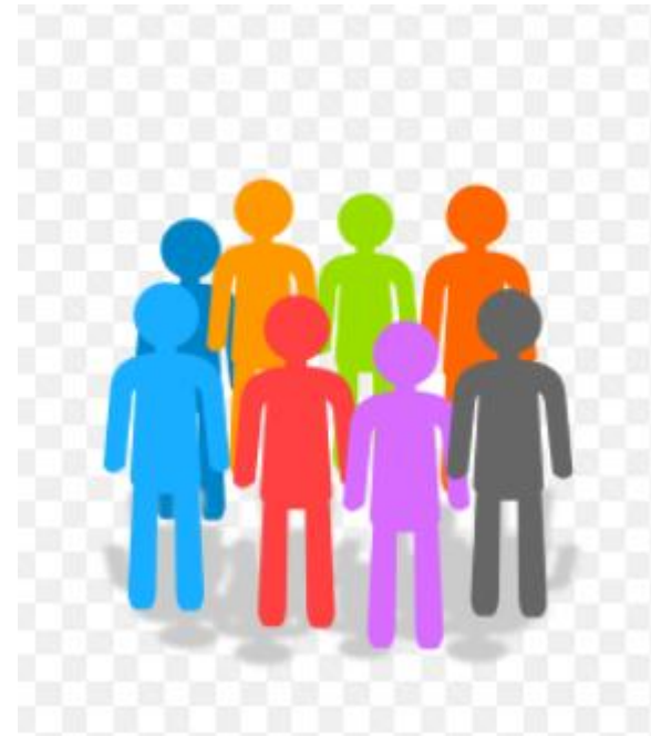
Global DNA Forum Meeting 2017, Bonn