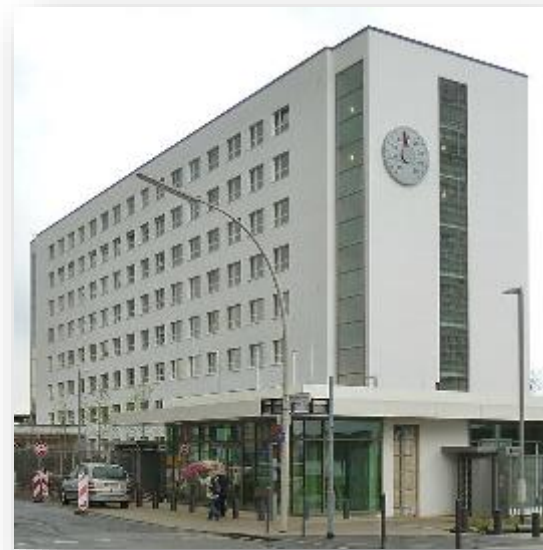
Global DNA Forum Meeting 2017, Bonn