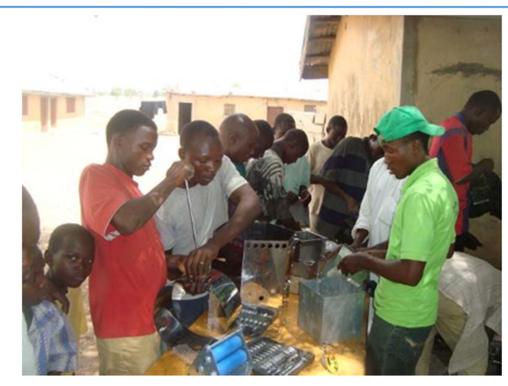
Energy Efficient Cookstoves