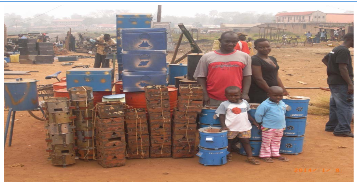
CDM Regional Collaboration Centre

A collaboration between the UNFCCC Climate Change Secretariat and the East African Development Bank