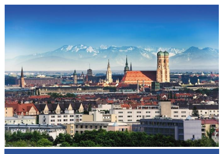
UPM Germany – Munich