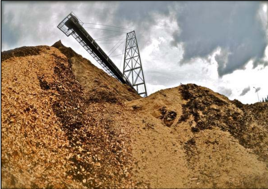
TITLE: Energy Dunes CDM PROJECT: 0268 Lages Methane Avoidance Project COUNTRY: Brazil