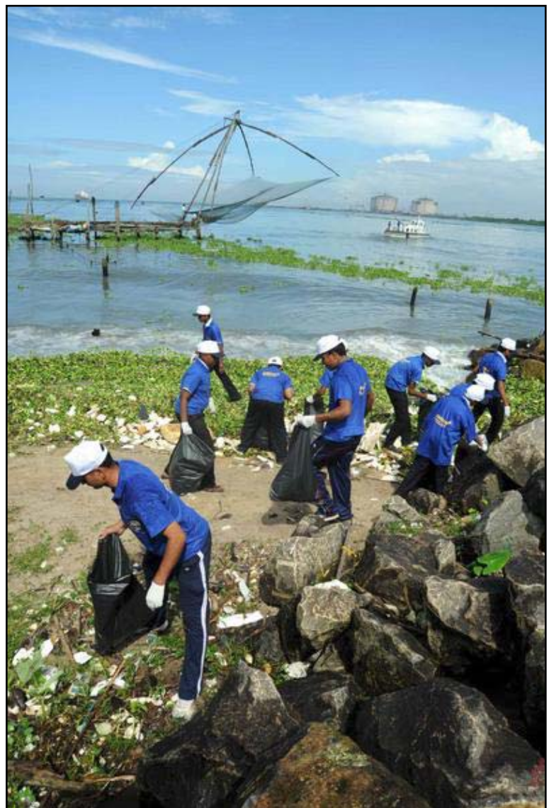
TITLE: Students Clean Up a Beach in South India After a Busy Tourist Season CDM PROJECT: 1904 Avoidance of Methane Emissions from Municipal Solid Waste and Food Waste through Composting COUNTRY: India