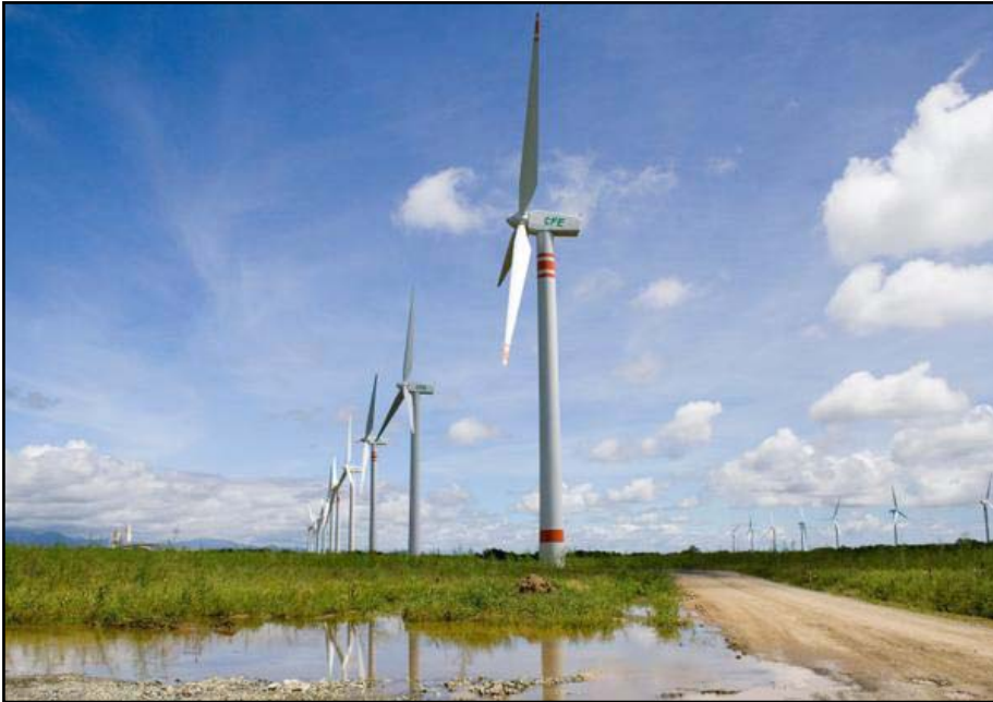
TITLE: Scudding CDM PROJECT: 0846 La Venta II COUNTRY: Mexico