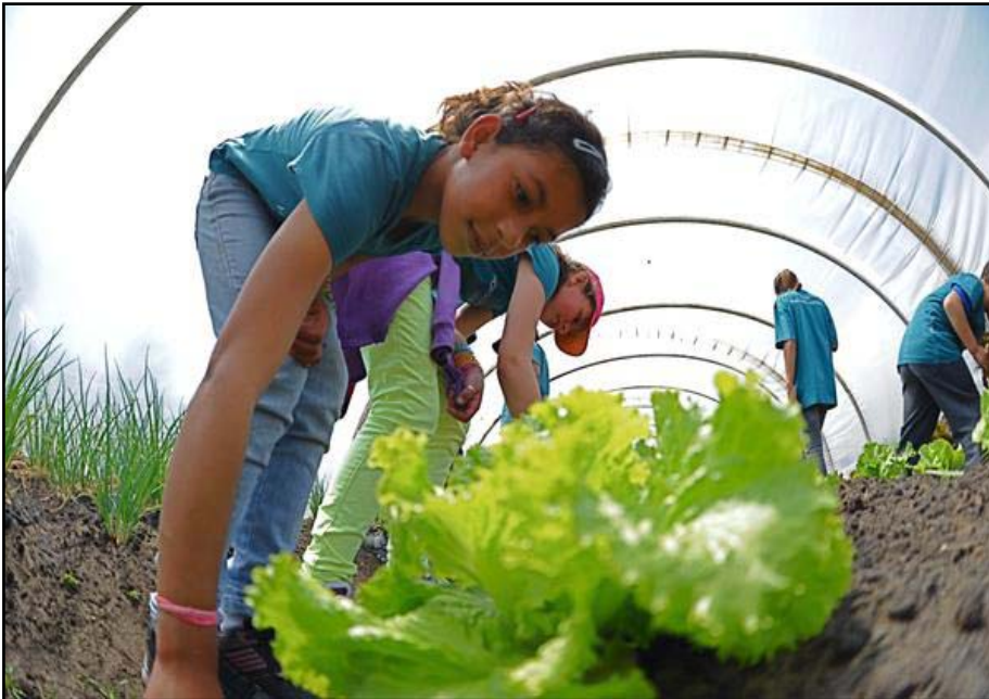
TITLE: Learning to Change CDM PROJECT: 0268 Lages Methane Avoidance Project COUNTRY: Brazil