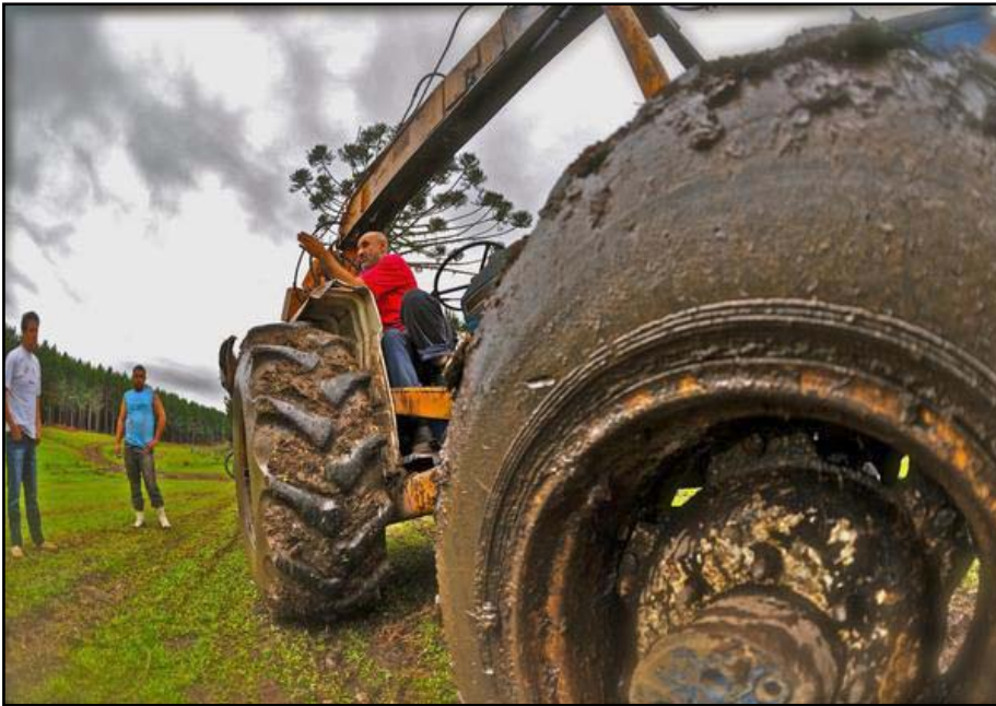
TITLE: New Horizons CDM PROJECT: 0268 Lages Methane Avoidance Project COUNTRY: Brazil