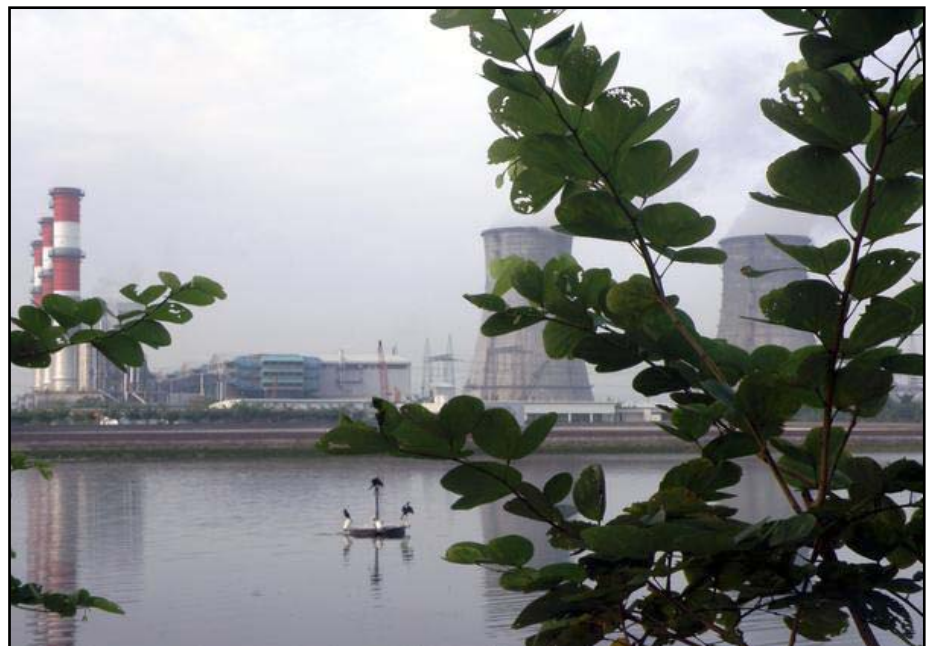
TITLE: A Power Plant With a Difference CDM PROJECT: 1116 1147.5 MW Natural Gas Based Grid Connected Combined Cycle Power Generation Project COUNTRY: India