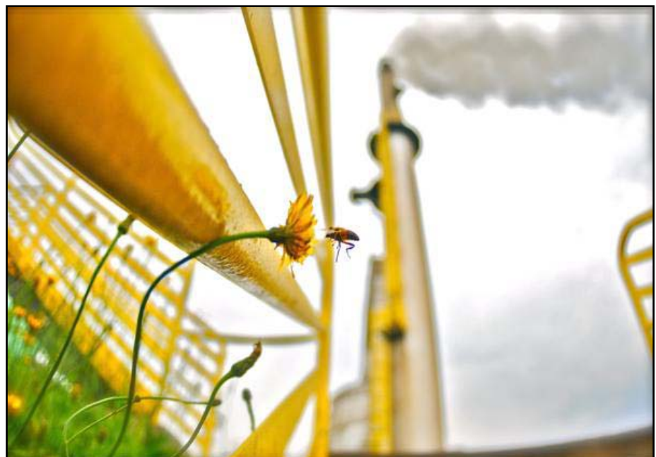
TITLE: AIR-Mony CDM PROJECT: 0268 Lages Methane Avoidance Project COUNTRY: Brazil