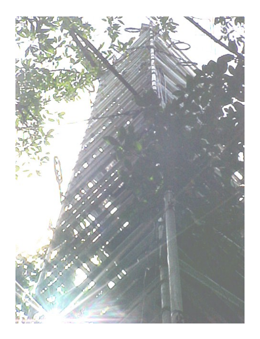
Figure 2 - Micrometeorological tower in the Bragança mangrove, Pará, Brazil (photo of Sergio Mattos - Fonseca, February, 2004).

In January of 2001 and November of 2002, months that correspond to the rainy and dry period at the region, respectively, record had been gotten whose resulted are summarized in table 2: