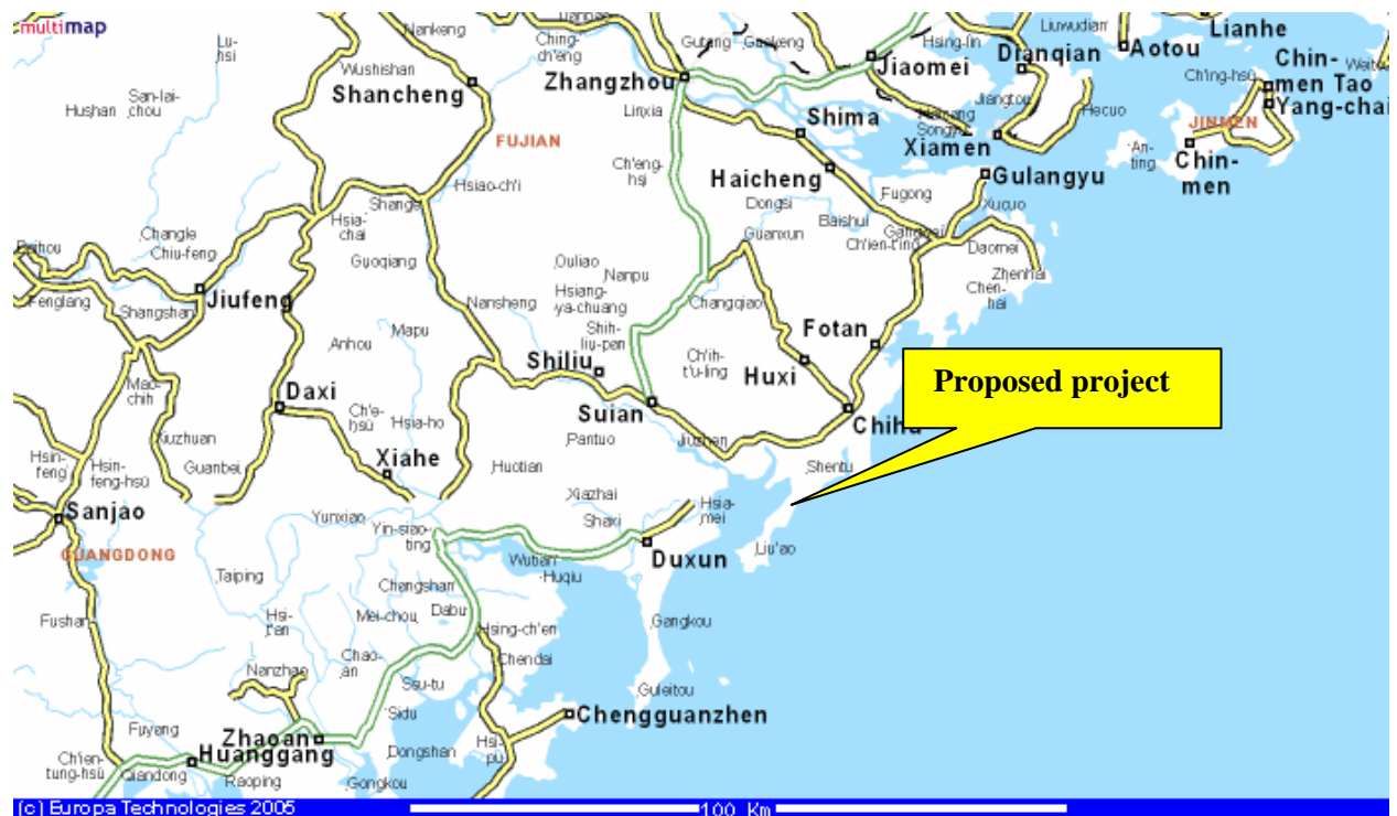
Figure A-1: Location of the proposed project