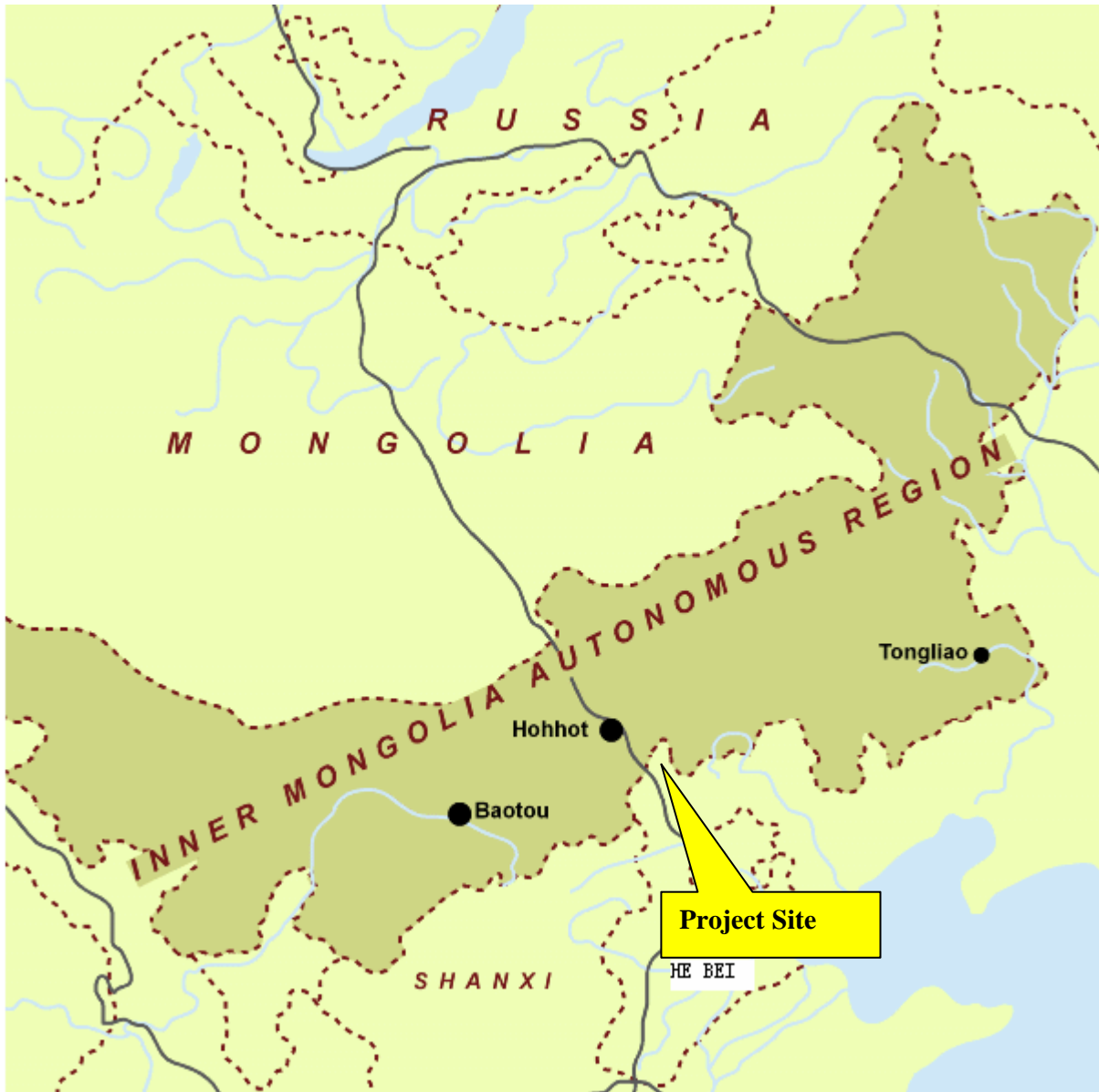
Figure 1 Map showing the location of the Project.