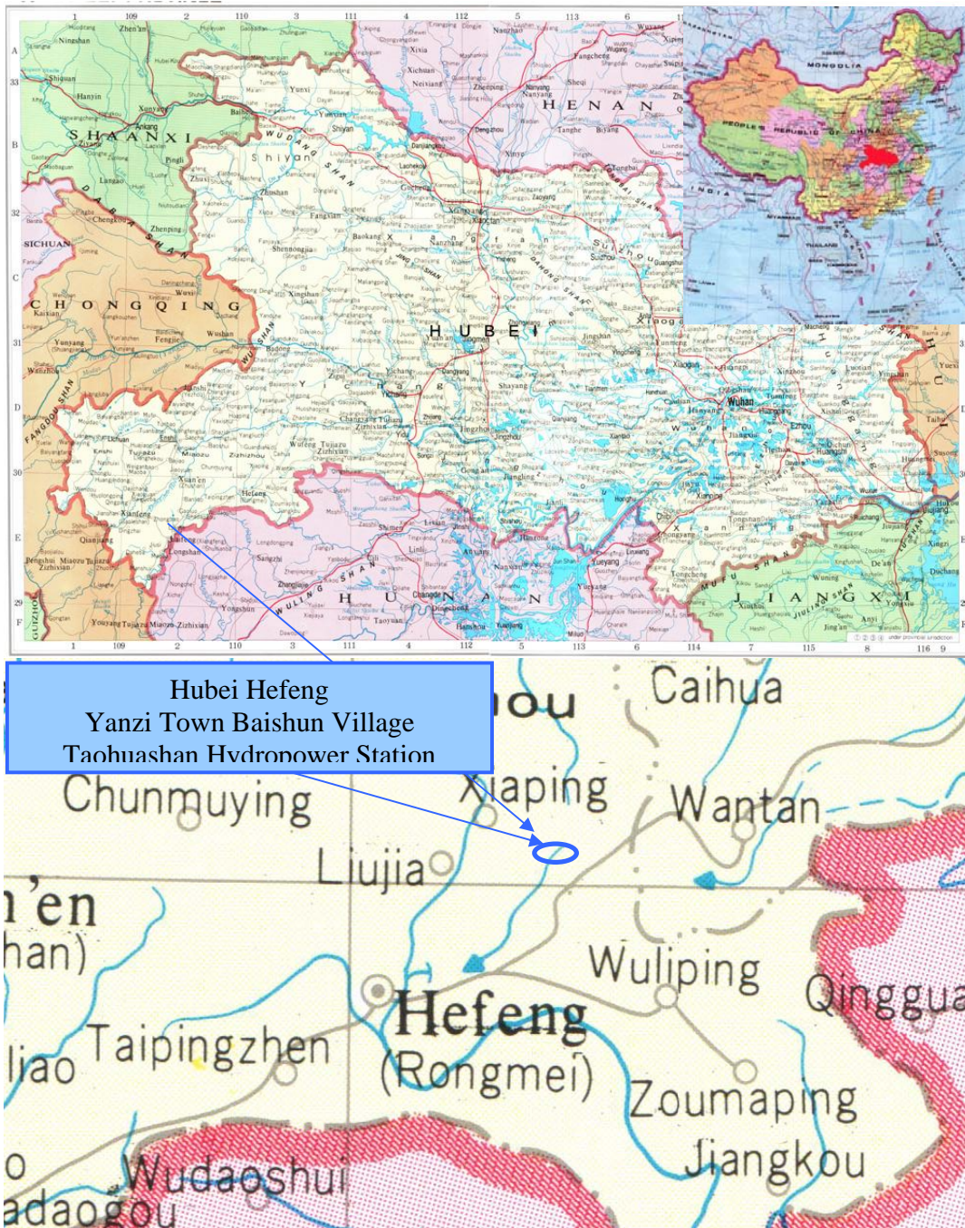
Figure 1 the Location of the project