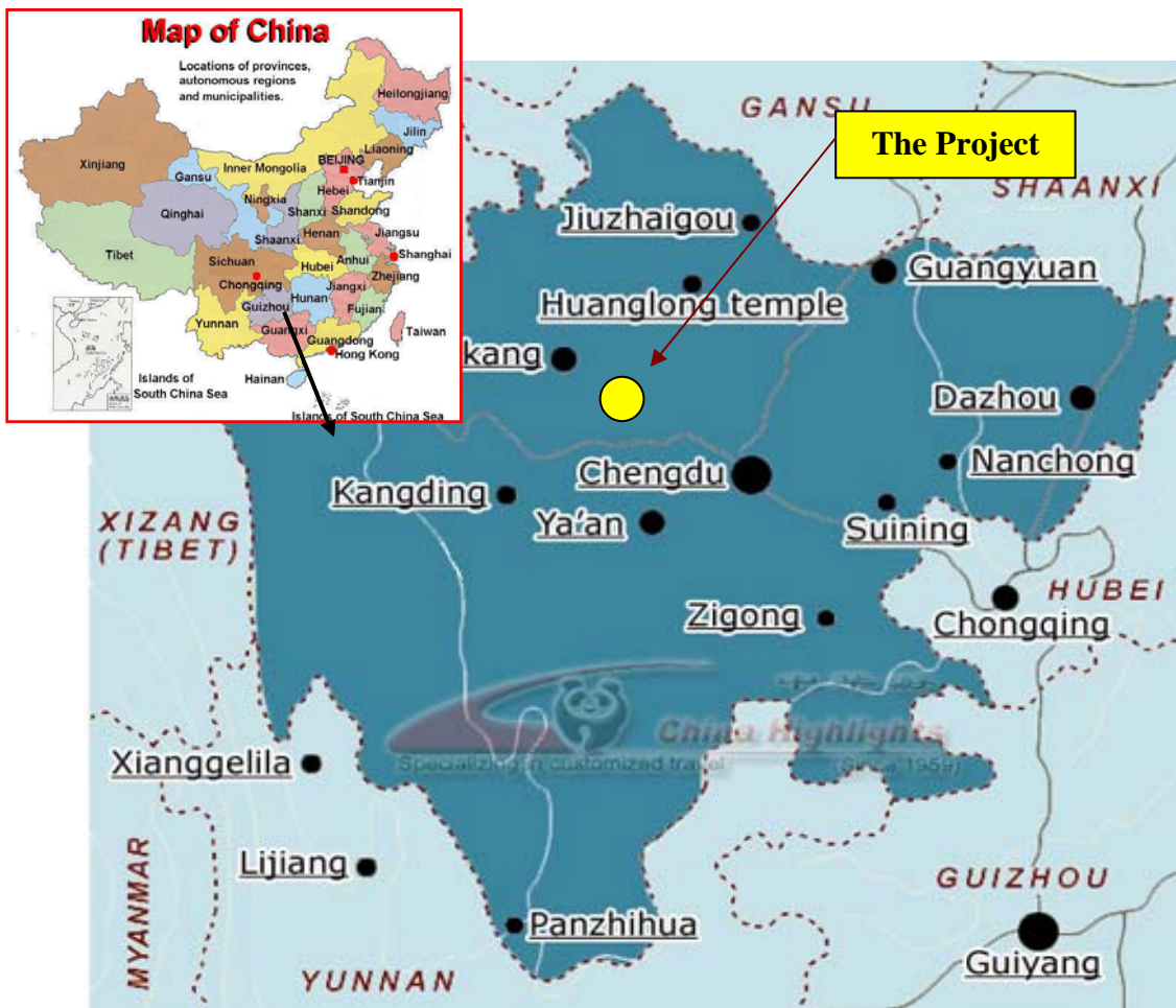
Figure 1 The location of Lixian Yikeyin Small Hydropower Project